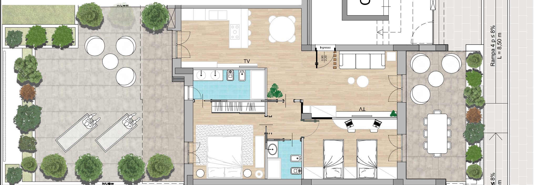
Pianta arredata - scala 1:100