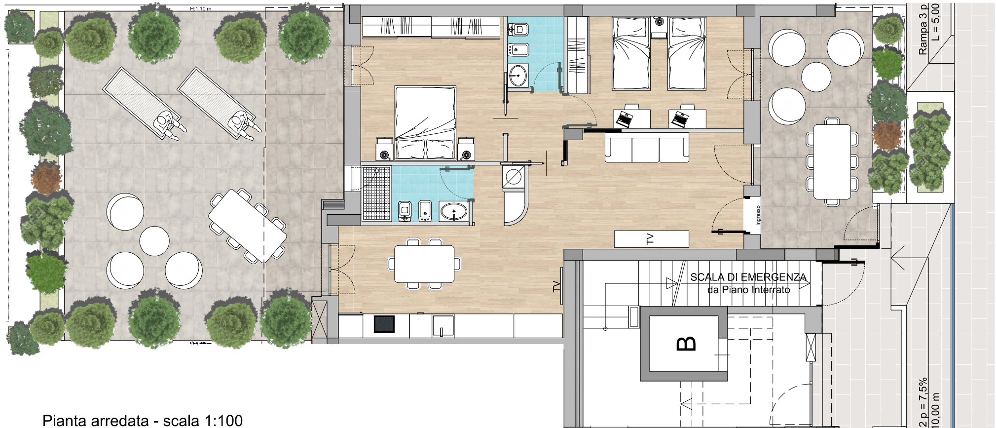
Pianta arredata - scala 1:100