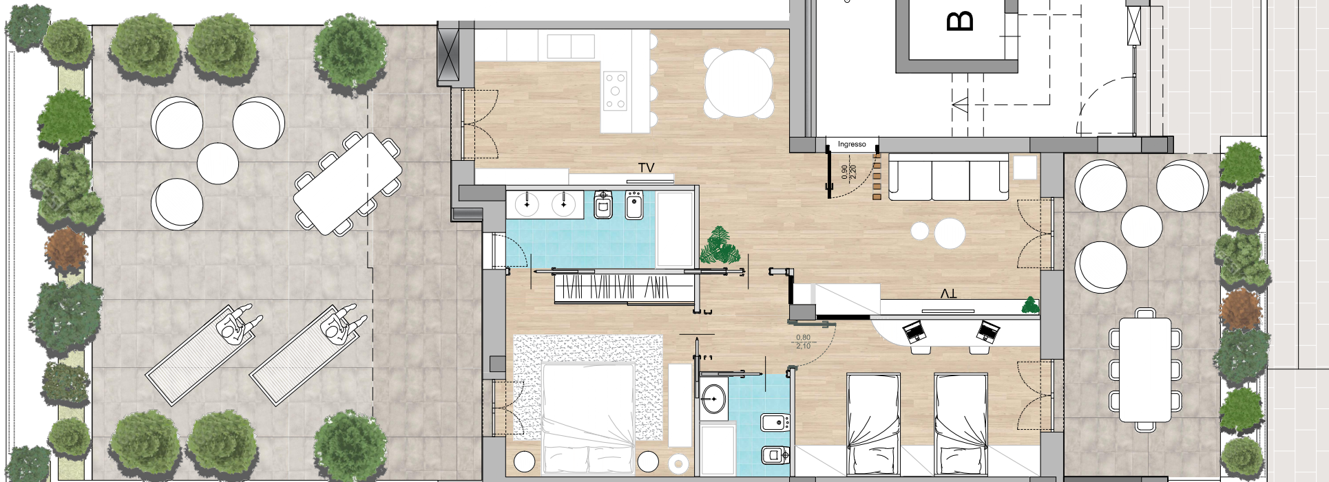
Pianta arredata - scala 1:100