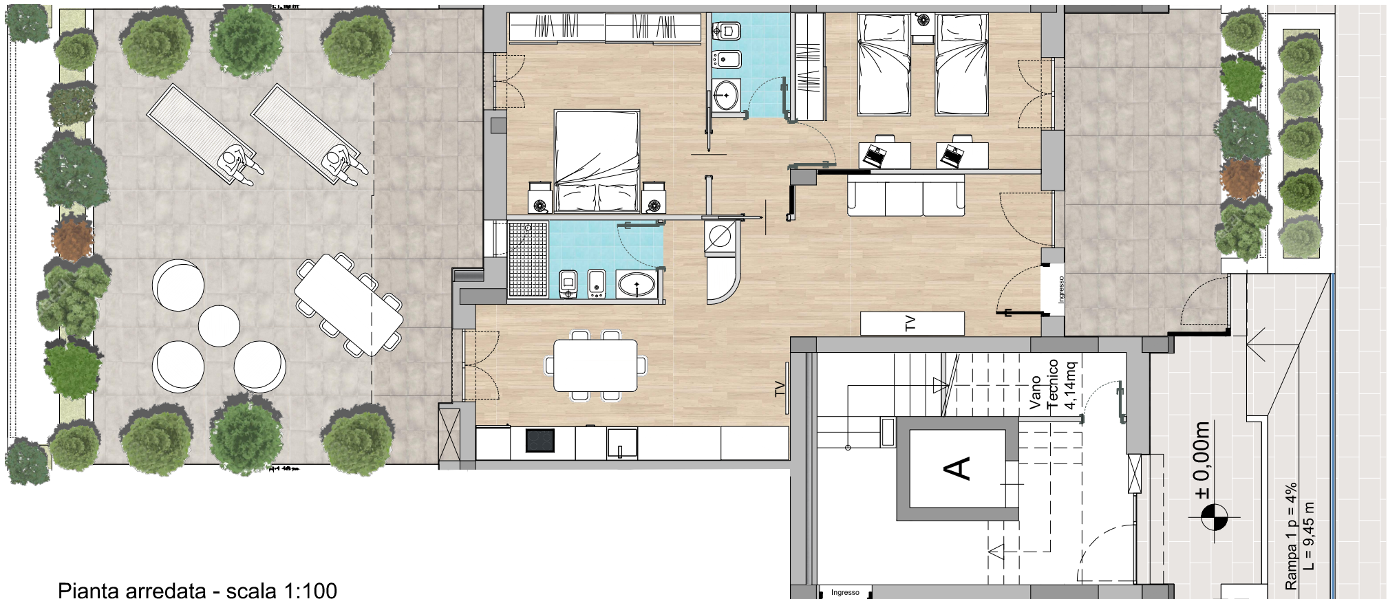
Pianta arredata - scala 1:100